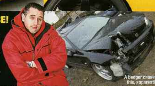
A badger caused this, apparently