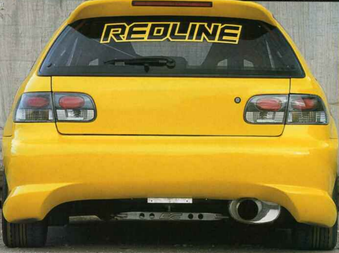
Smoothly does it

After three years spanking around in fast motors, Clifty left Redline to work in the heady world of retail - at Ripspeed, Yeovil. The new store is one of five specialist departments aimed at modders, and stocks all sorts of trick kit for your motor. They also stock Poppy Carols and bearded seat covers if you fancy some of that! For your nearest Ripspeed specialist store call 0870 444 1876.