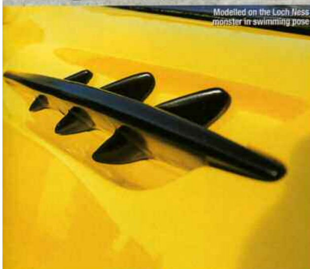
Modelled on the Loch Ness monster in swimming pose

Clifty changes his mind more often than he changes his pants (what, once every two weeks? - Davy). The first flip green/gold/purple looked wicked, but by the time the rest of the car was finished, he was bored and shipped the car off to Avon Customs for a load more work and an in-yr-face yellow House of Kolor paintjob.