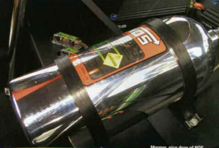
Mmmm, nice drop of NOS

The high revving VTEC lump is a tidy unit as standard, but Clifty wanted more. He's freed up more power with a rorty sounding Simota induction kit and DC Sports exhaust. But the icing on the cake is the NOS which gives an extra 50bhp for when he's really, really, really late.